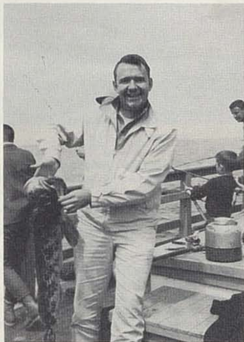
They said it couldn't be done