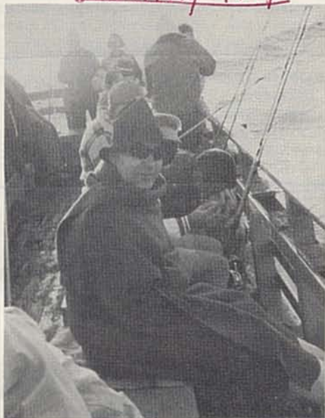
What do you mean "Start Fishing".

Baseball Shoes - 2 pair, size 6, rubber cleats $1.75, size 7 1/2 steel cleats $3.50. Hardly worn. Call 377-5018 - Mornings.