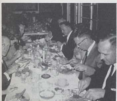
PLEASE DON'T TAKE MY PLATE AWAY YET!!