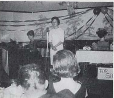
PENSIVE BUT LOVELY