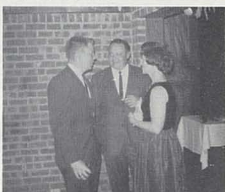
AND THEN THE FARMER SAID TO THE SALESMAN...