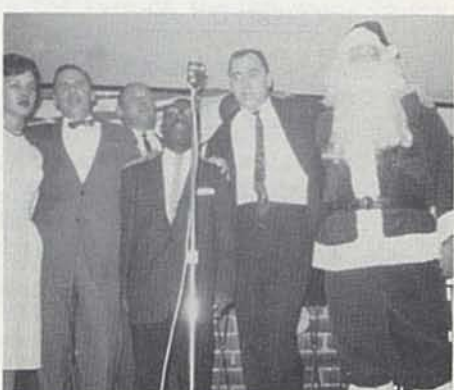
THAT OLD GANG OF MINE.....