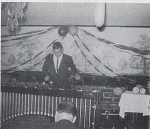
AT THE TONE THE TIME WILL BE.....