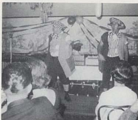
YOU SAID IT WOULD BE A FRIENDLY GROUP

Minds Are Like Parachutes . . . They Won't Work Unless They Are Open.