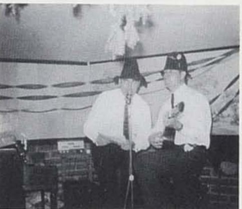
YOU AIN'T NOTHIN' BUT A HOUND DOG....