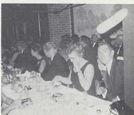
DON'T CRY - THE FOOD WILL COME EVENTUALLY