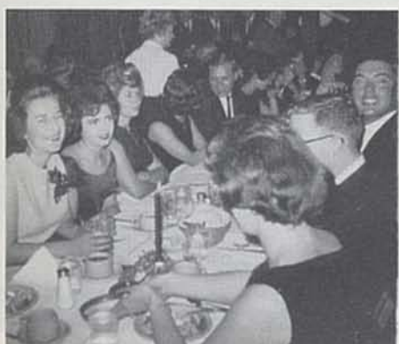
SMILE, YOU'RE ON CANDID CAMERA!