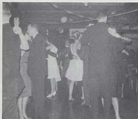
I COULD HAVE DANCED ALL NIGHT BUT I LOST MY SHOES