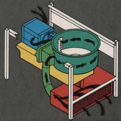
Patented Airflow System

The Memorex disc airflow system uses air movement generated from the spinning disc pack to both cool the linear motor and clean the read/write heads. This reduces parts count by eliminating the need for separate cooling blowers. The unique airflow system also reduces the risk of thermal shutdown and pack contamination.